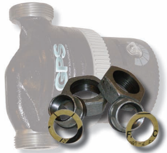
Galvanised union kit for E6 Vario