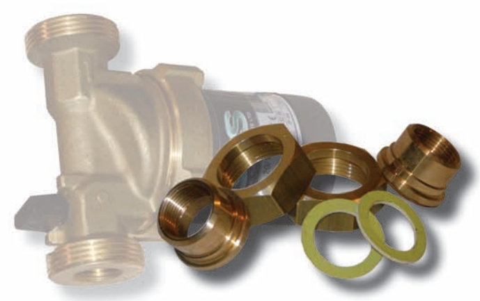
Bronze union kit for E3 vario